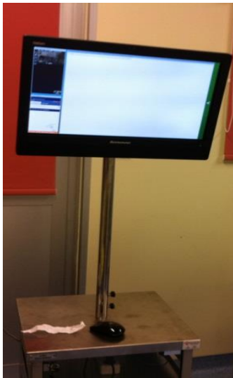
Figure 2: The station in the patient's home