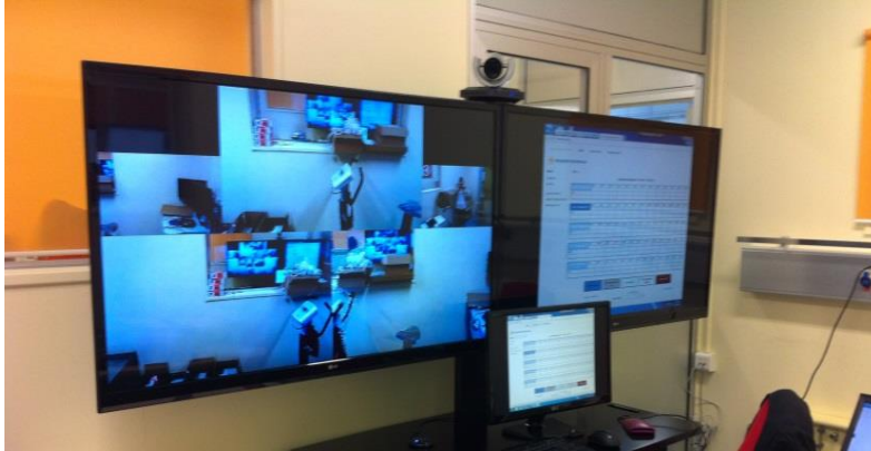
Figure 1: Central station of the physiotherapist at hospital

accessible for all care providers. Patients are asked to sign an informed consent that allows the use of collected data for research and developmental purposes.