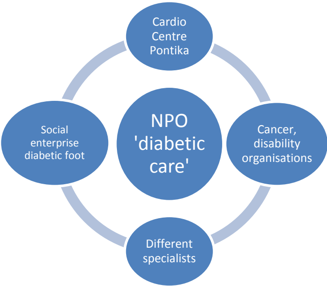
Figure 2. The network of providers